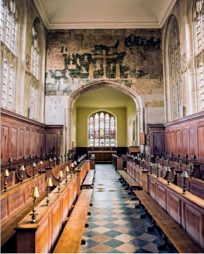
The interior of the Guild Chapel