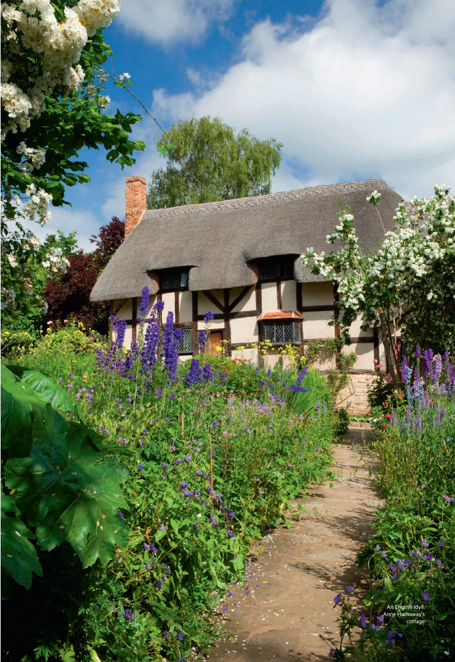
An English idyll: Anne Hathaway's cottage