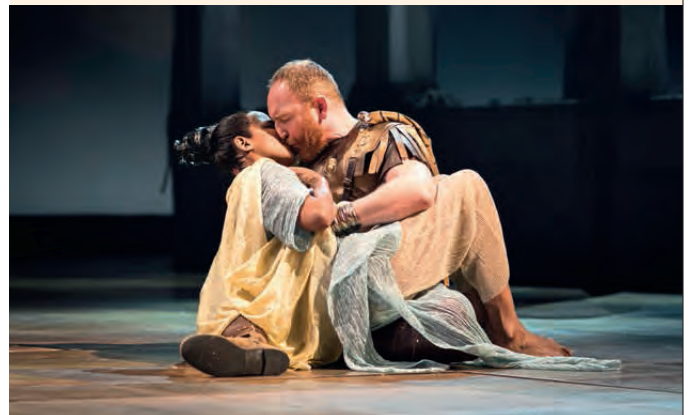
A production of Shakespeare's Antony and Cleopatra in Stratford this year

See www.visitbritain.com and www.visitbritainshop.de