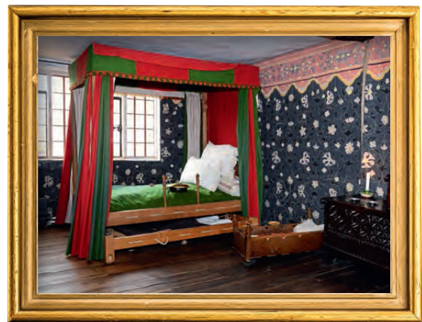
His first hours: the room where Shakespeare was born