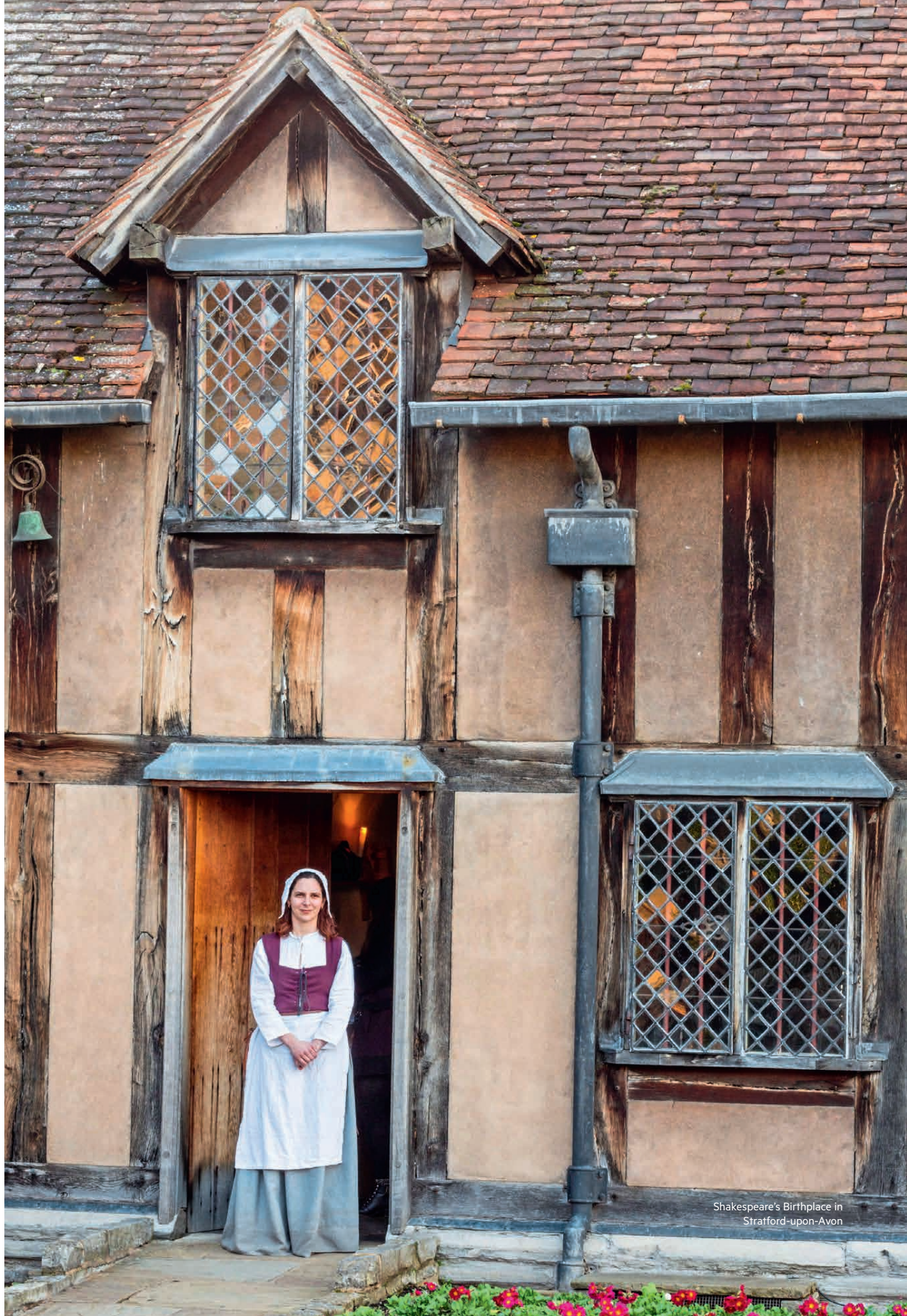
Shakespeare's Birthplace in Stratford-upon-Avon