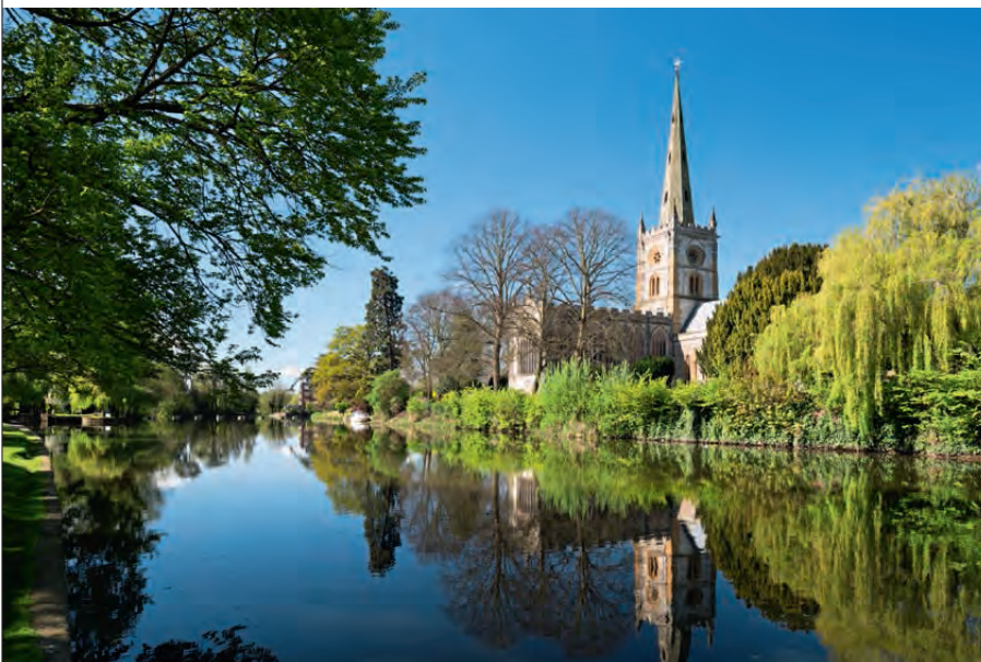
Final resting place: Holy Trinity Church in Stratford-upon-Avon, where Shakespeare is buried